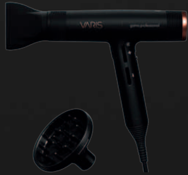
IQ Dryer + Diffuser